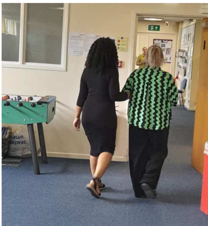
Guiding Training at Community Central.