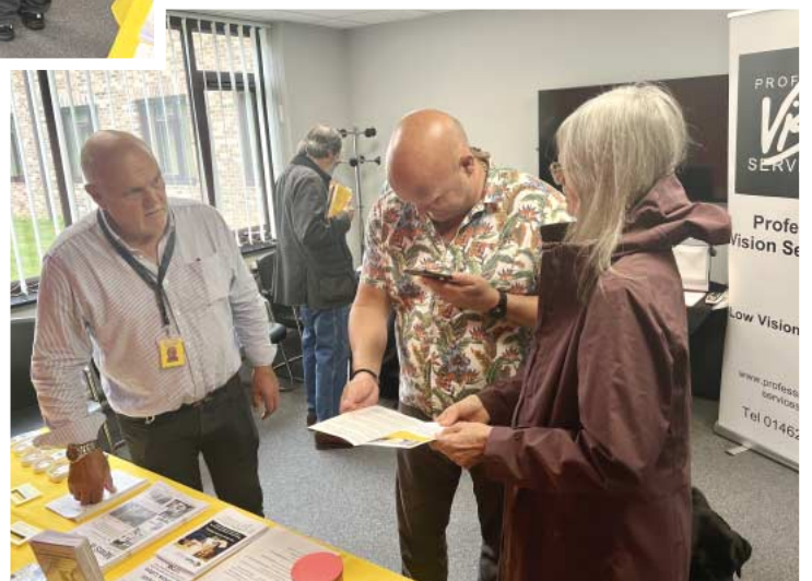
2023 July 25 Drop in day with Professional Vision Services at Cople Village Hall.