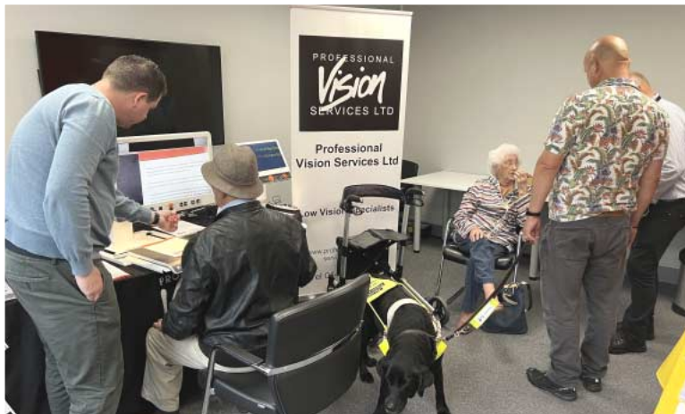
Left and Below: 2023 July 24 Drop in day with Professional Vision Services at Rufus Centre.