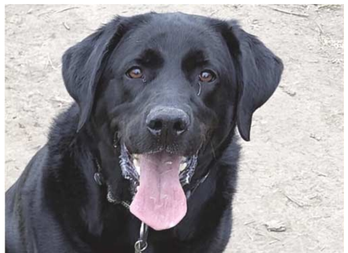
Close up of Usef's face looking very happy during a 'Take on 250' sponsored walk last year.