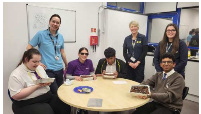
Youth Forum joins Guide Dogs UK cookery class.