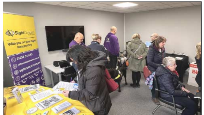
Professional Vision Services Flitwick drop-in day.