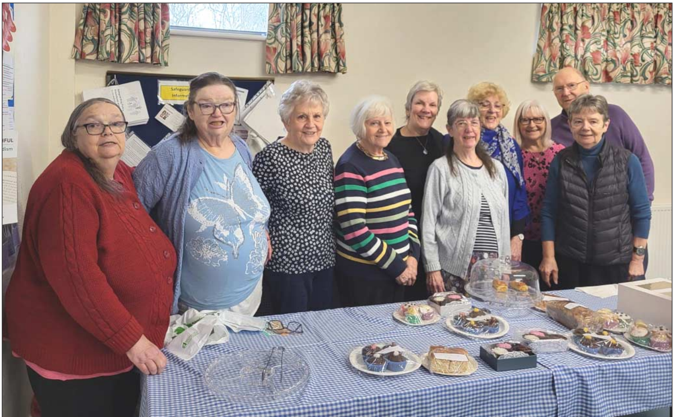
Photo shows stall holders, tea makers and organisers from Clapham Methodist Church.

We would like to thank everyone that nominated us, and for all the hard work that has already gone into fundraising for us!