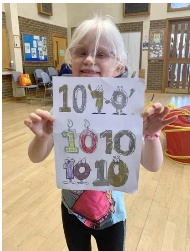
Photo shows a young girl at Family Group proudly holding a number 10 colouring in sheet.