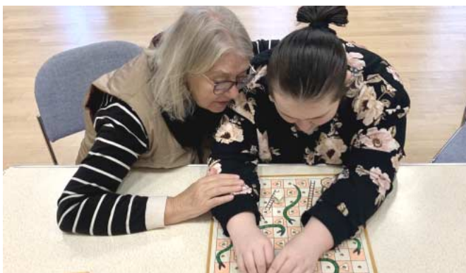
Family Group – volunteer helps with tactile Snakes & Ladders.