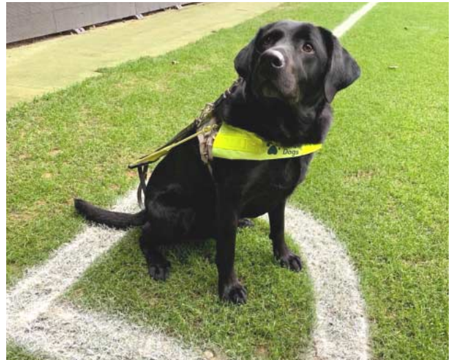
Usef on the corner spot at Kenilworth Road, ready to take a Premiership corner for the Hatters.