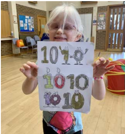
Family Group 10th Anniversary.